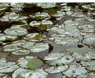
Photograph without Filter