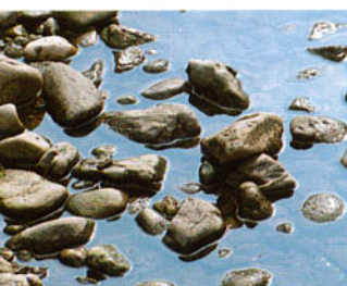
Photograph without Filter