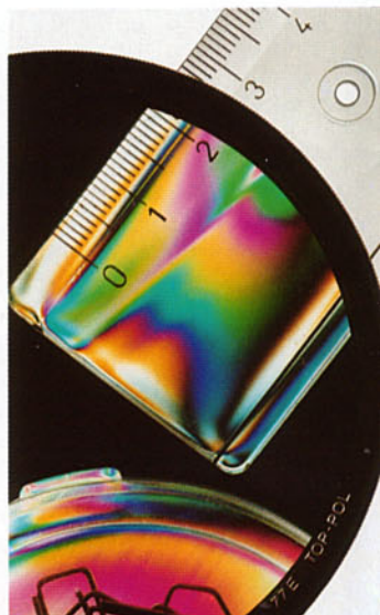
With B+W Pol Foil 5