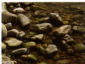
With Filter B+W Top Pol 1