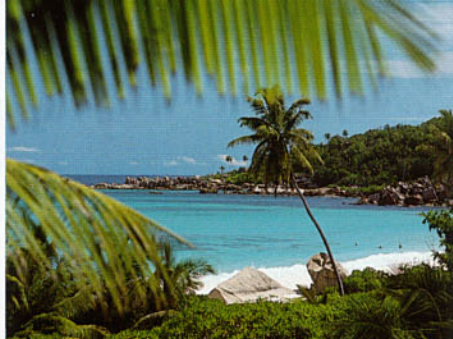
With Filter B+W Top-Pol 1