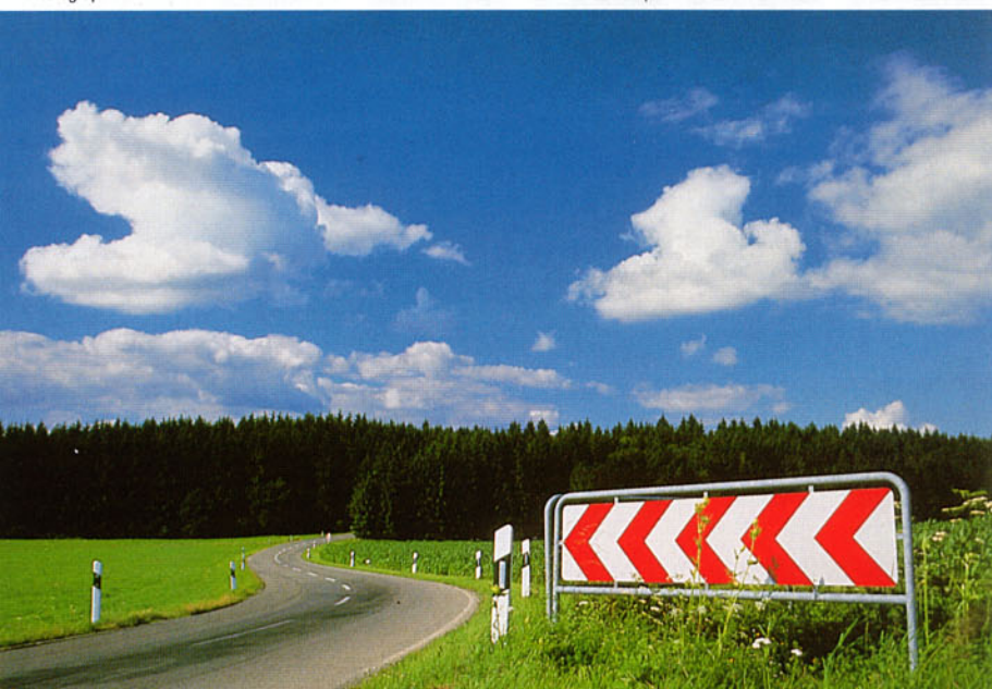
With B+W Kasemann Pol Filter 3