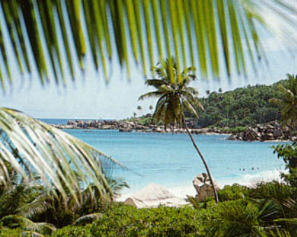
Photograph without Filter